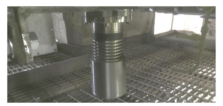
Figure 3: Hydro-Mix HT Installed

Hydro-Mix HT sensors are constructed of stainless steel and have an abrasion-proof ceramic measuring faceplate. The sensor is designed to be installed flush-mounted with the surface of the mechanical material transport system allowing the material to flow freely over the measuring faceplate without causing any build-up.